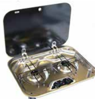
040321 SMEV 2 HOB With Flush Mounted Glass Lid