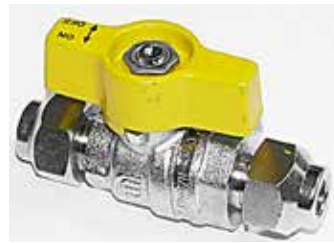
BALL VALVE 5/16SAE