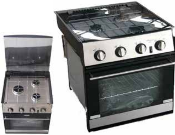
041811 TRIPLEX Rapid 3 Burner with Grill and Oven Satin Knobs