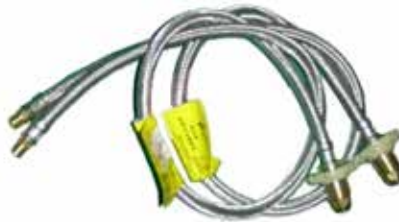
PIG TAIL - BRAIDED with Wheel Sold Separately