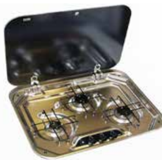
040393 SMEV 3 HOB With Flush Mounted Glass Lid