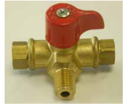
2 Way Gas "T" Valve