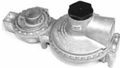
MARSHALL SINGLE D.P.P. REGULATOR