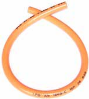
LPG HOSE (Per Metre)