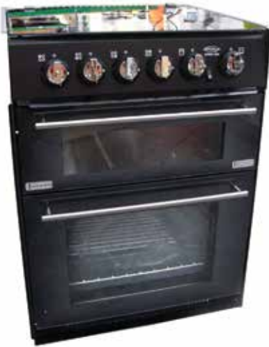
041809 CHARCOAL Chrome Knobs with T Bar Styled Handles With Oven Light