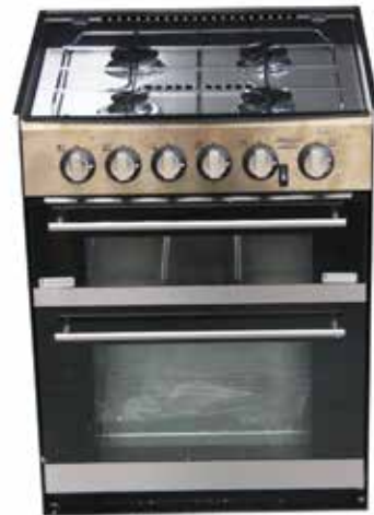
041808 MIDNIGHT Satin Knobs with T Bar Styled Handles