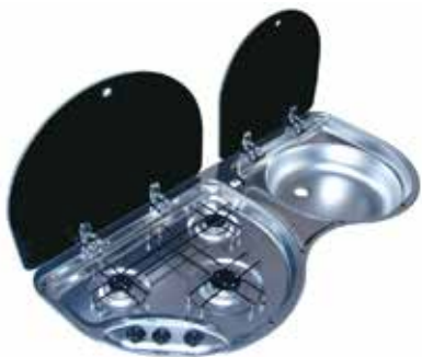
040853 SMEV 3 HOB AND RH SINK COMBO 3 Burner - Tap Sold Separately - Glass Lid