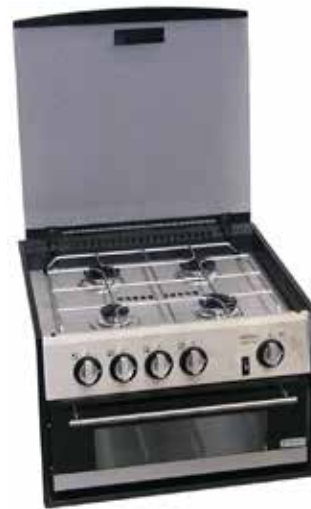
041810 MINIGRILL 4 Burner with Grill Satin Knobs