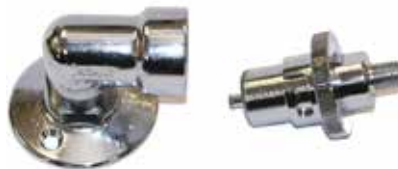
BAYONET PLUG SYSTEM FOR PORTABLE HEATERS