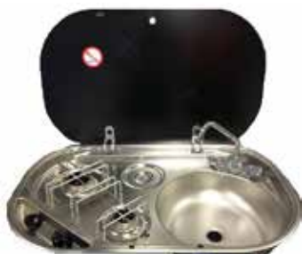
040394 SMEV 2 BURNER HOB AND RH SINK COMBO 2 Burner - Tap included - Glass Lid